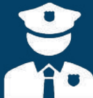
KYC & Verification