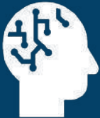
AI Powered Platform

Our AI powered products provide you with rich Open Banking insights to build a complete, real time picture of your customers financial position, which empowers you to make more informed decisions.